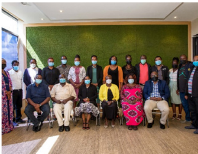
Left: Participants in the 1st workshop in January