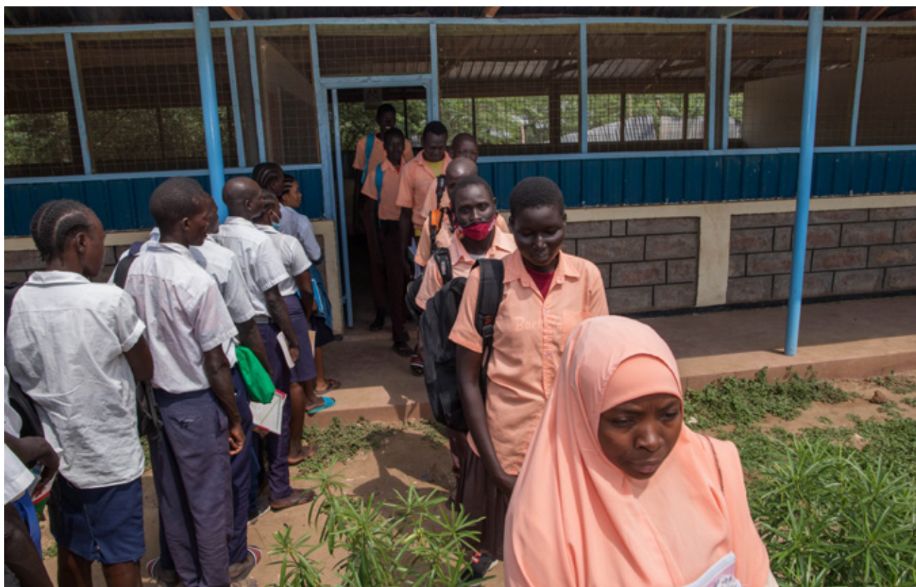
Students in school B exit a class as School A learners prepare to enter a classroom in KRSS

WIK runs and manages a total of 15 Secondary Schools, 9 in Kakuma Camp and Kalobeyei Settlement and 6 in Dadaab Refugee Camp.