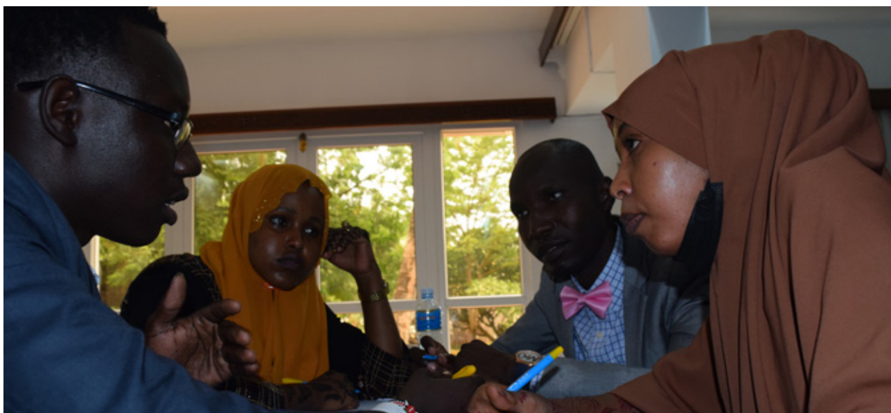
Some of the scholars in a brain storming session at the conference

WIK student conferences are a great opportunity for scholars from different Universities & colleges to meet, share ideas, network and get mentorship support.