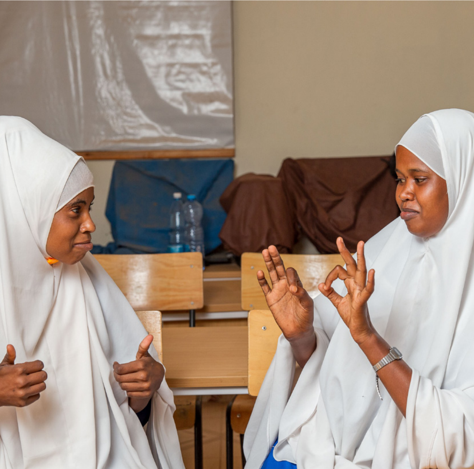
Hearing impaired learners in a classroom at IFO Secondary School in Dadaab.