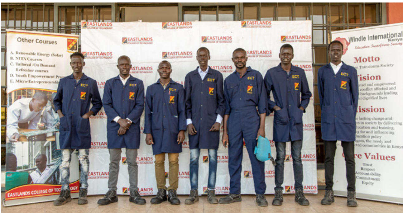
Top: The 1st cohort of 7 scholars at Eastlands College of Technology

The first cohort of 7 Male scholars joined the programme in January 2021 to undertake training courses in Mechanical Engineering, Automotive Technology and Electricals Technology.