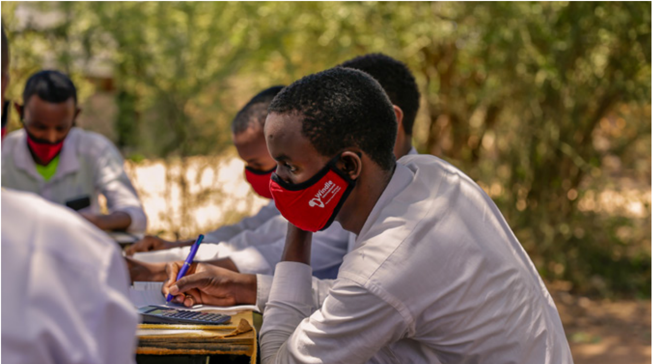
Students from Waberi Secondary School in Dadaab revising for exams.

A total of 2,376 (1,815 Male, 561 Female) candidates from Kakuma Schools and 1,170 (764 M, 406 F) from Dadaab Schools sat for the 2021 Kenya Certificate of Secondary Education (KCSE) examinations. The 3 weeks and 1 day exam period started on 11th March, ending on 1st April 2022.