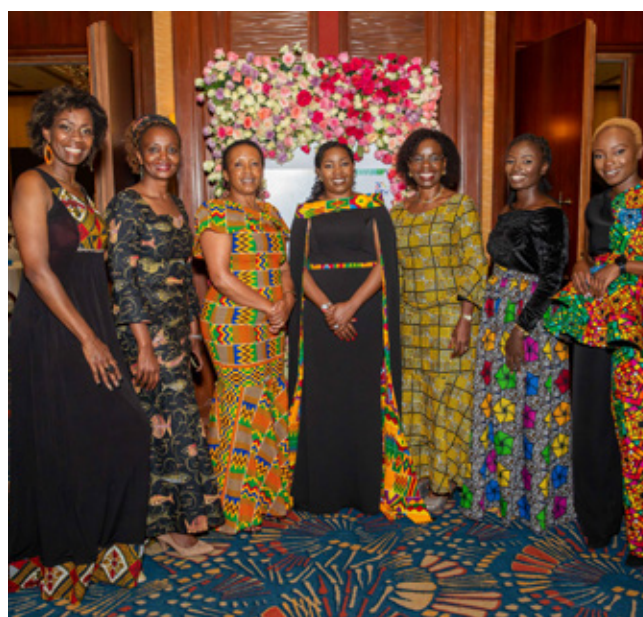
Left: WIK stand at the Gala event