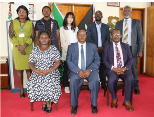
Left: A section of WIK staff with Moi University Officials Right: with MMUST University officials.

The DAFI scholarship programme is currently supporting a total of 594 (138 F, 456 M) scholars across 32 partner universities and colleges country widely.