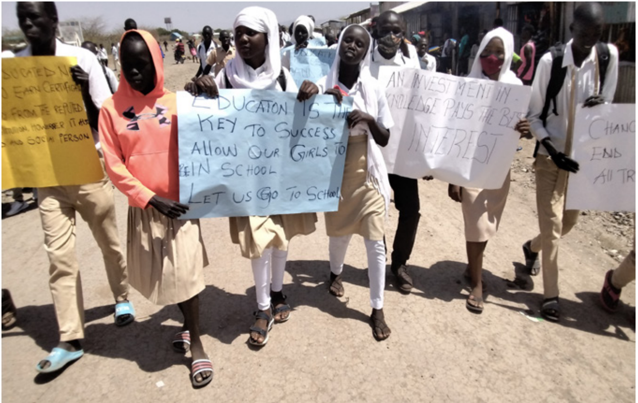
A section of the students marching with placards

In commemoration of the day, Students of Somali Bantu Secondary School in Kakuma together with their teachers marched from their school in Kakuma to neighboring communities and centers to create awareness on education issues.