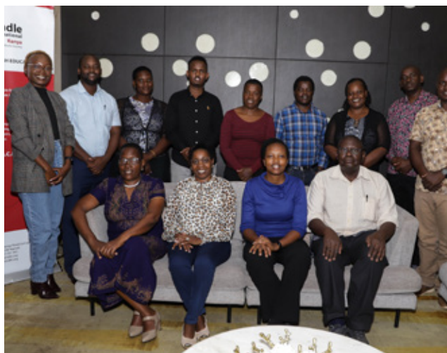
Right: Participants in the 2nd workshop in April.