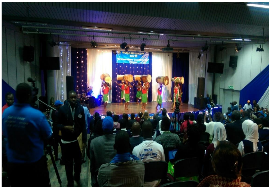
INSET: A PACKED LOUIS LEAKEY AUDITORIUM WATCHING A BURUNDIAN DANCE